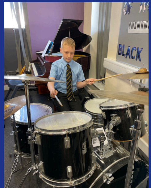
Hit it! Percussion Club. Lunchtime Thursday and Friday.