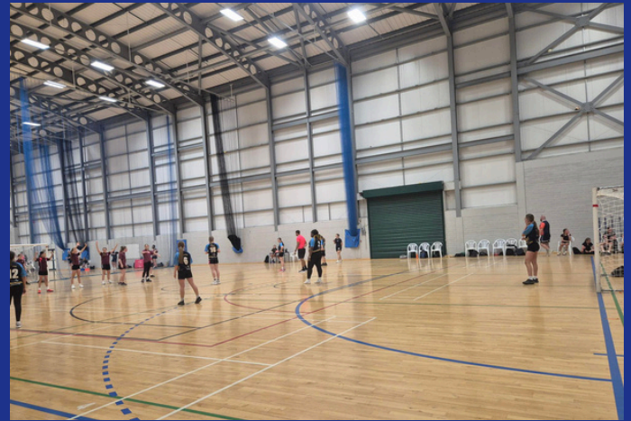
U13 Girls take 4 th place at South-East Regional Handball Competition.