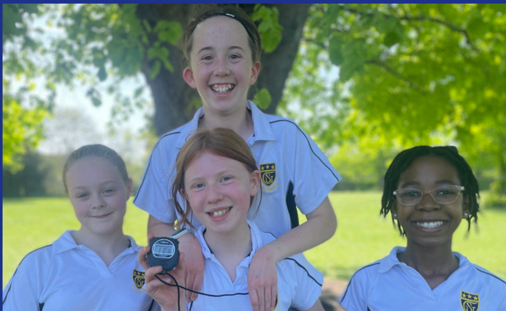
Athletics Club! Every Tuesday After School.