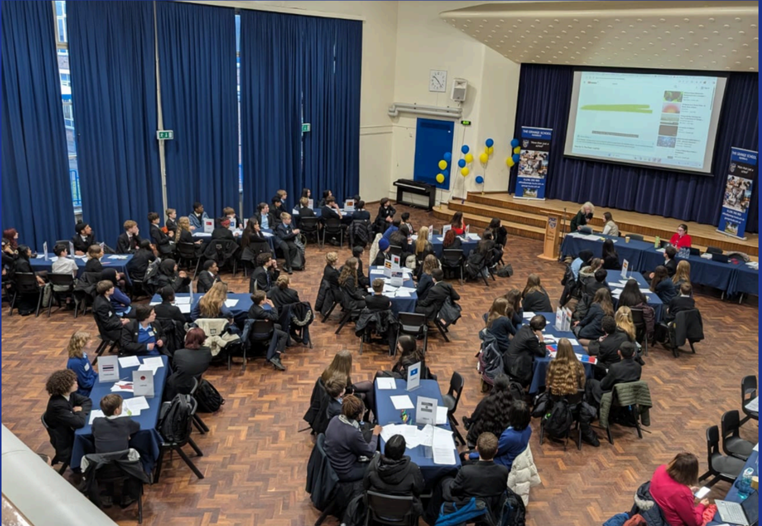
Buckinghamshire Council Model United Nations Training Event