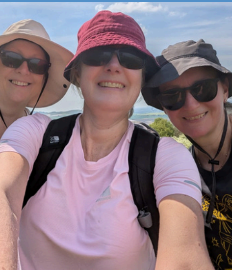
Our fantastic Duke of Edinburgh Practice Walk at Dunstable Downs